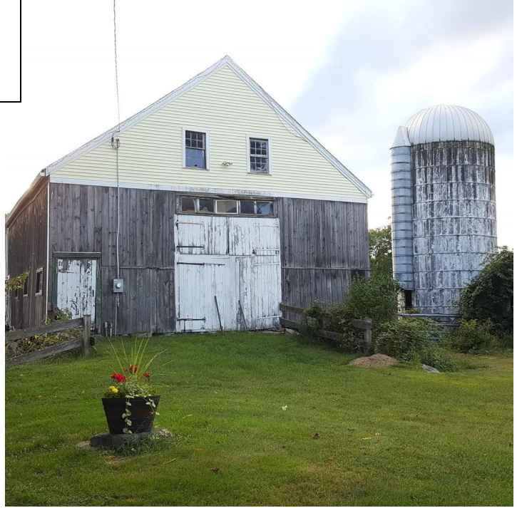
The silo, a big part of the landscape at SHF