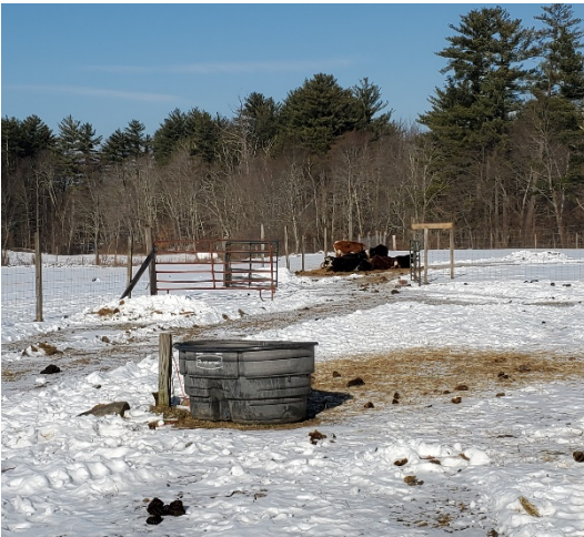
Look closely...there are cows...

A barn raising was a gathering at which people in a community cooperatively erected the framework of a neighbors barn, typically followed by a celebration. (Oh, to have been able to attend!)