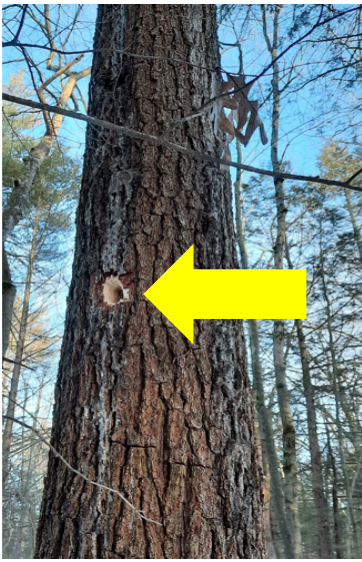
Handy work of Pileated woodpecker

Although the winter time does not bustle with wildlife as much as the warmer months, there is still a lot of activity going on. Birds that spend all year in New Hampshire can still be spotted like the Northern Cardinal, Black-capped Chickadee, Tufted Titmouse and Blue Jay. The Dark-eyed Junco is a familiar bird in winter months, as their flocks come to back yards, open woodlands and fields specifically in winter. There are always woodpeckers, if you look at the trees you can see evidence of them pecking and drilling into soft, diseased or aging trees filled with delicious insects for them to snack on. The Pileated Woodpecker makes noticeable holes in trees that can end up being used by other birds or small animals as nest cavities. Also, be sure to look for animal tracks in the snow such as fox, coyote, bobcat, raccoon, eastern cottontail and if you are really lucky, fisher or mink. All of these can be found at Spring Hill Farm by a good observer. Right now some of these animals are looking for mates so they will be active. Have fun going out and looking for winter wildlife, if you have pictures we would love to see them!